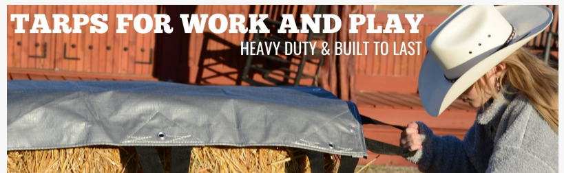
heavy duty tarp