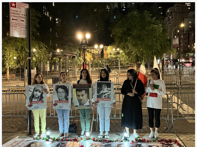
Iranian Americans Hold Picket Line Near UN Headquarters in NYC, 09/21/2024