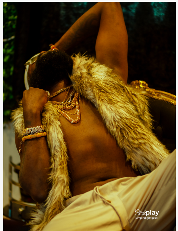
Sean Dampete, afrobeats super sensation