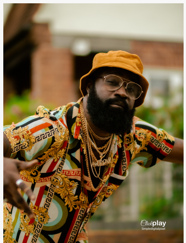
Sean Dampete, afrobeats super sensation

With production from notable names like Jomane,