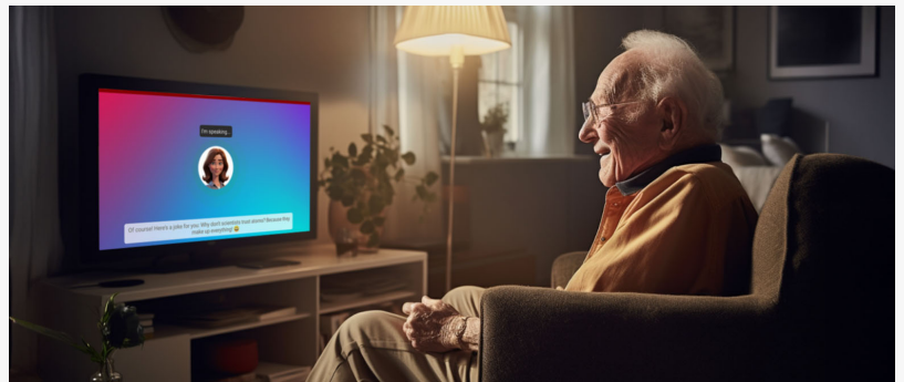
Joy, the senior AI Companion on the TV

EINPresswire.com/ -- ONSCREEN , Inc., a leader in AI-powered and TV-based senior care technology, is proud to announce the release of several new AI