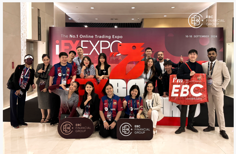
The EBC Financial Group team gathers at the iFX Expo Asia 2024 in Bangkok, representing their brand and partnership with FC Barcelona.