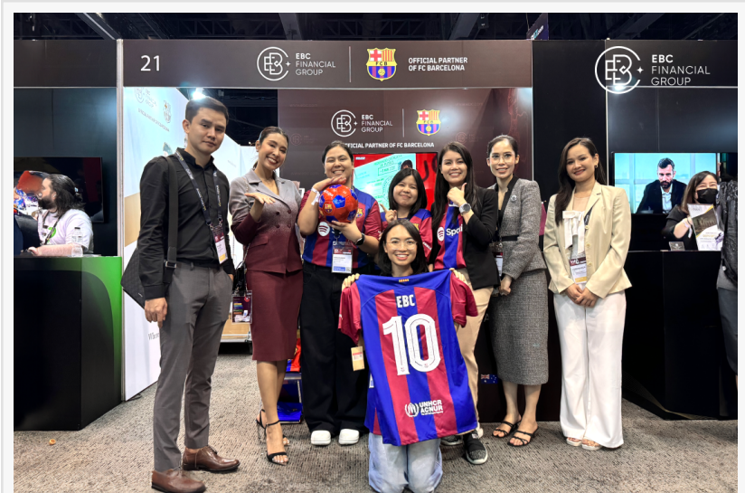
EBC Financial Group team members and attendees proudly display FC Barcelona co-branded merchandise at the iFX Expo Asia 2024 in Bangkok, highlighting the company's official partnership with the iconic football club.

EBC Financial Group saw a remarkable turnout at its booth, with attendees showing great interest in the company's advanced trading technologies, brokerage services, and tailored financial solutions. Over the