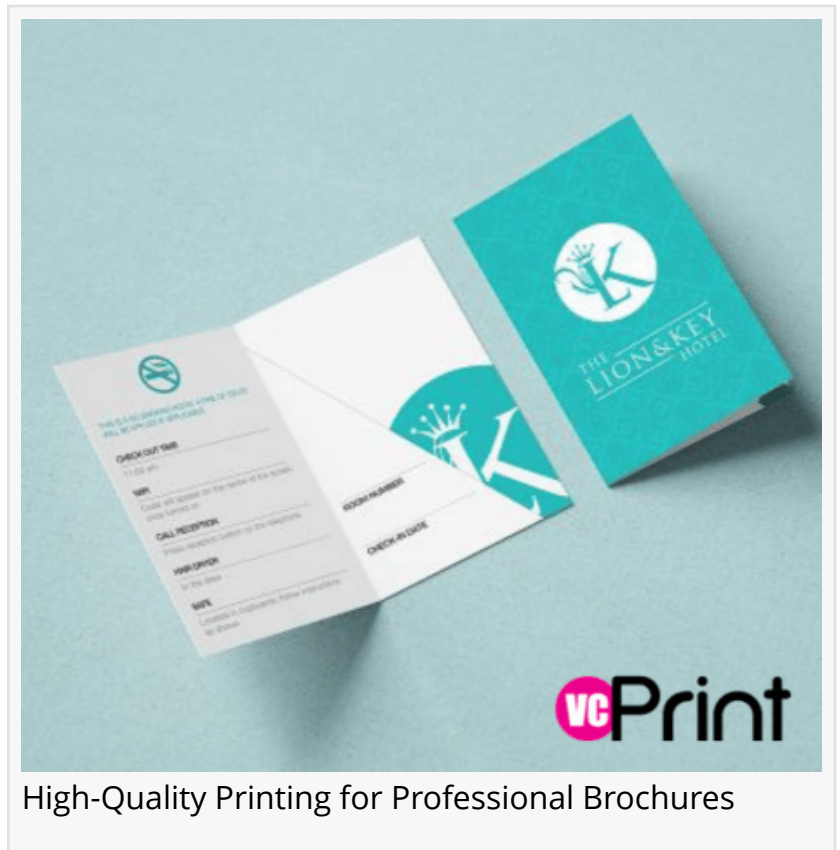
High-Quality Printing for Professional Brochures

This press release can be viewed online at: https://www.einpresswire.com/article/746068812