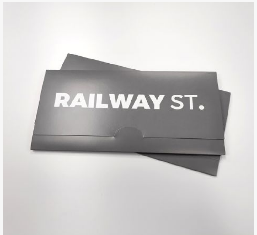
Keep Transactions Organized And Easily Accessible.