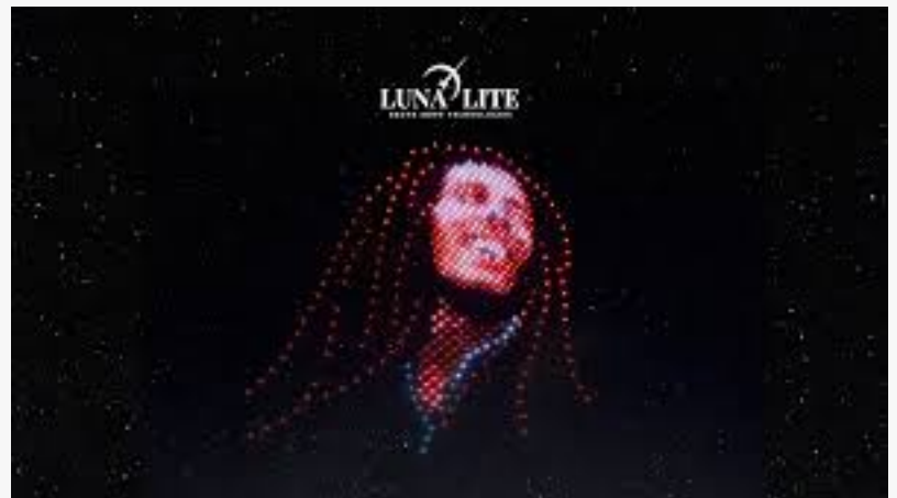
Illuminating the Caribbean and beyond with LunaLite Drone Show Technologies