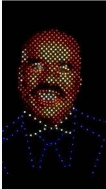
Steve Harvey Lights Up The Sky At InvestFest Atlanta 2024

As the premier drone show partner for Cayman Pirates Week and Cayman Cookout, LunaLite is poised to bring their innovative storytelling to international audiences. In addition to their Caribbean ventures, LunaLite is currently working to provide drone shows for major soccer and