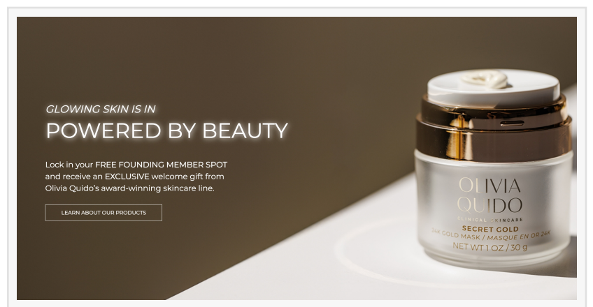
Club o product