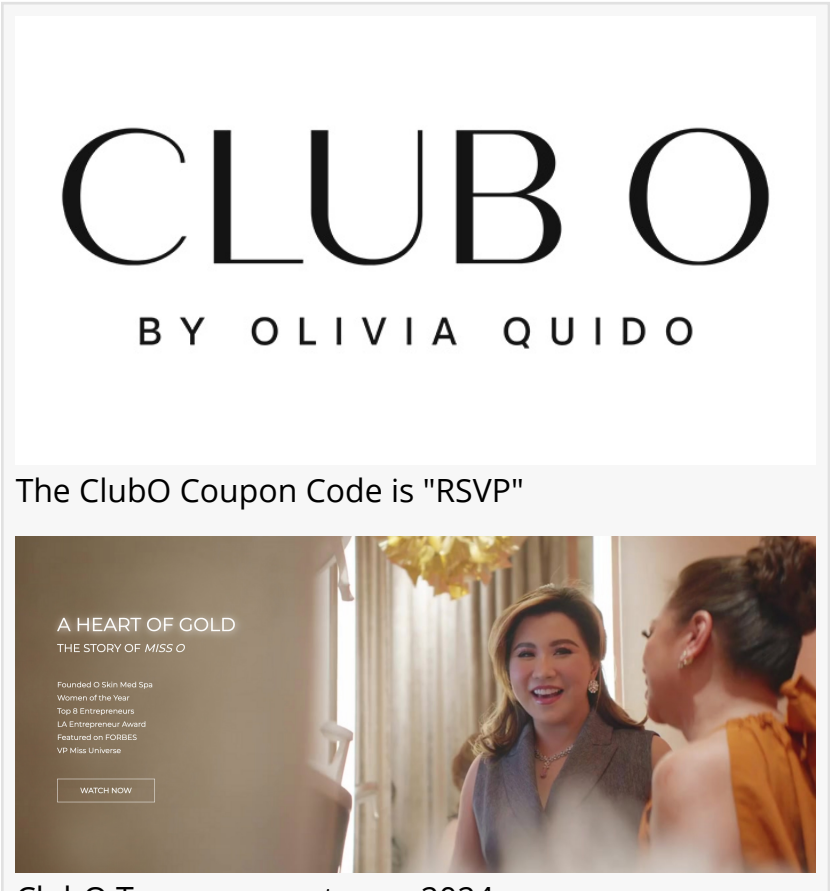
ClubO Top revenue stream 2024

LOS ANGELES, CA, UNITED STATES, September 24, 2024 / EINPresswire.com/ -- ClubO is announcing the exclusive launch of its limited "ClubO Coupon Code," providing customers with an opportunity to save on both ClubO memberships and products. By using the ClubO Promo Code "RSVP" at checkout, shoppers can enjoy exclusive discounts across the ClubO Shop. This limited-time offer is perfect for those looking to save on gifts for friends and family, particularly with the holidays and Christmas right around the corner.