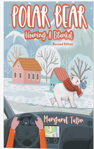
"Polar Bear Wearing A Blanket"