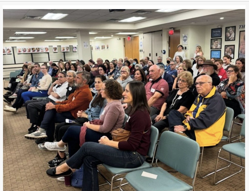
Jewish community listening intently

This event forms part of AMMWEC's ongoing commitment to fostering interfaith dialogue and understanding.