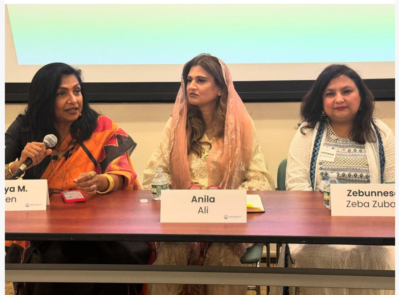
Muslim Women Speakers Condemn terrorism and antisemitism