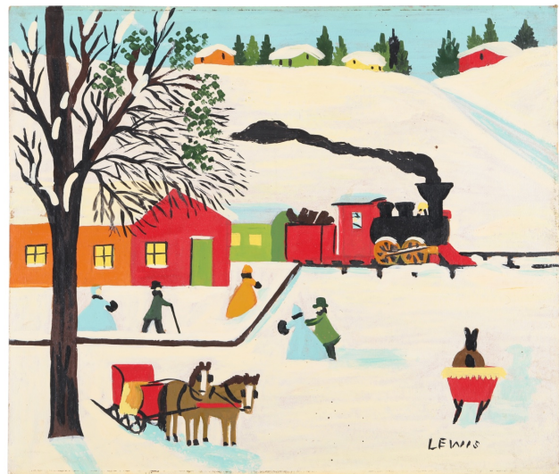
Oil on beaverboard painting by acclaimed Nova Scotia artist Maud Lewis (1901-1970), titled Train Station in Winter (circa 1960-1961), artist signed (est. CA$30,000-$40,000).