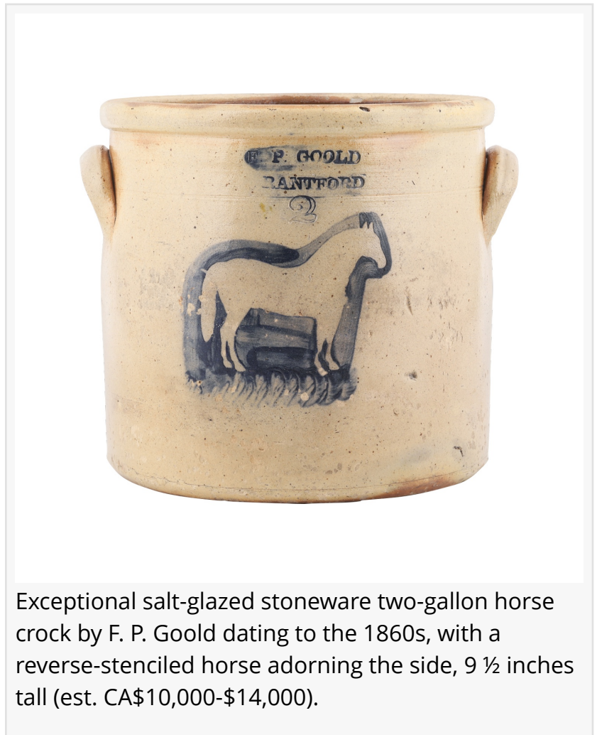
Exceptional salt-glazed stoneware two-gallon horse crock by F. P. Goold dating to the 1860s, with a reverse-stenciled horse adorning the side, 9 ½ inches tall (est. CA$10,000-$14,000).

An oil on canvas painting by noted French artist Édouard Leon Cortès (1882-1969), titled Paris at Dusk (circa 1908-1925), depicts the City of Lights at twilight, with the Arc de Triomphe in the background. It's in very good condition, re-lined and professionally mounted onto a new stretcher. The 13 inch by 18 inch work (canvas, less frame) is artist signed and stamped 'Toronto' on the frame's back (est. $10,000-$12,000).