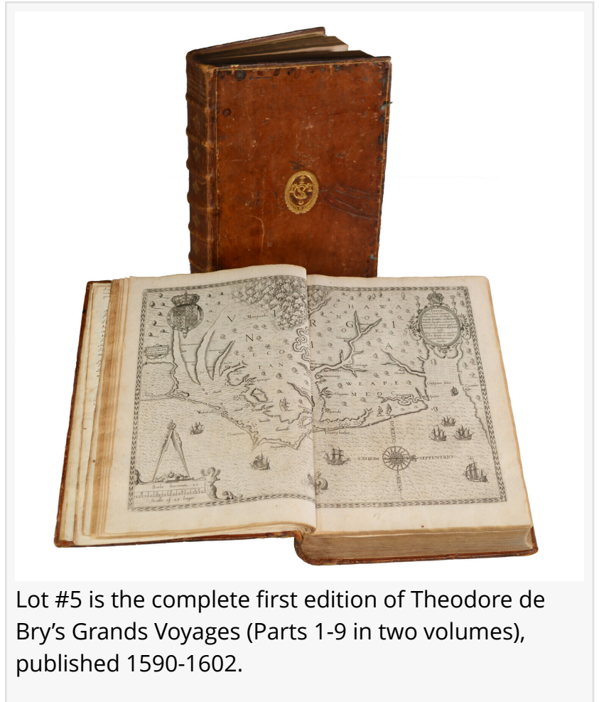
Lot #5 is the complete first edition of Theodore de Bry's Grands Voyages (Parts 1-9 in two volumes), published 1590-1602.

The brief but important catalog includes two of the most important collections of travels and voyages from the 16th century, some of the earliest images of Native Americans available to a European audience, and iconic maps that influenced mapmakers for centuries.