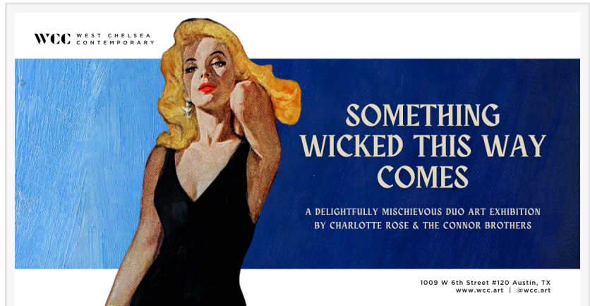
Something Wicked This Way Comes

The Connor Brothers, known for their satirical take on modern life and