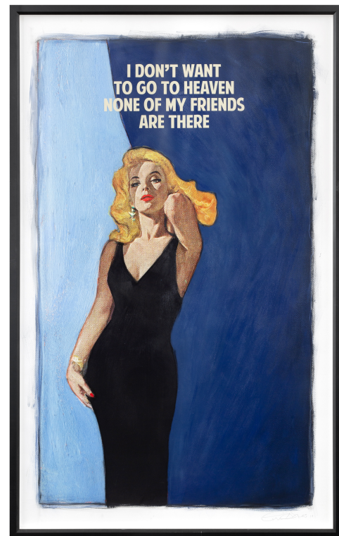
The Connor Brothers, I Don't Want to Go to Heaven, None of My Friends are There