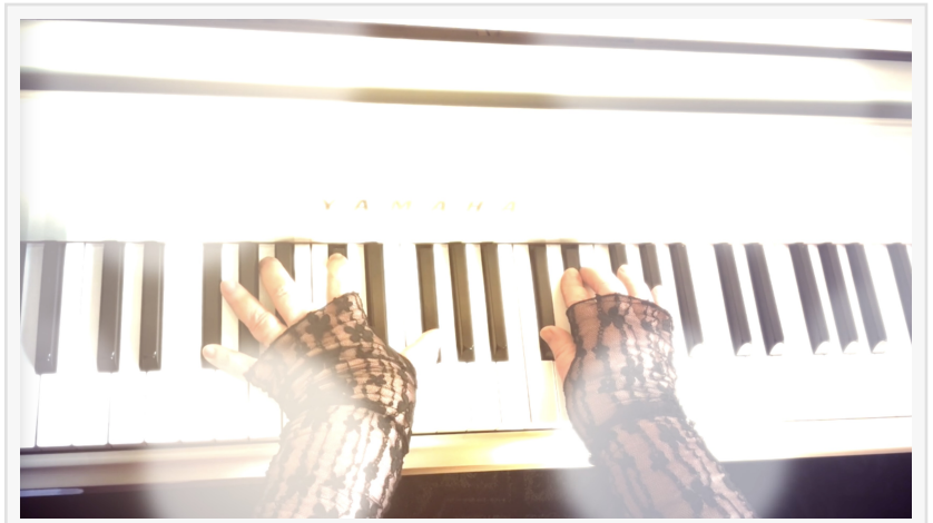
A scene from the music video 'Eleven'

This press release can be viewed online at: https://www.einpresswire.com/article/746186856