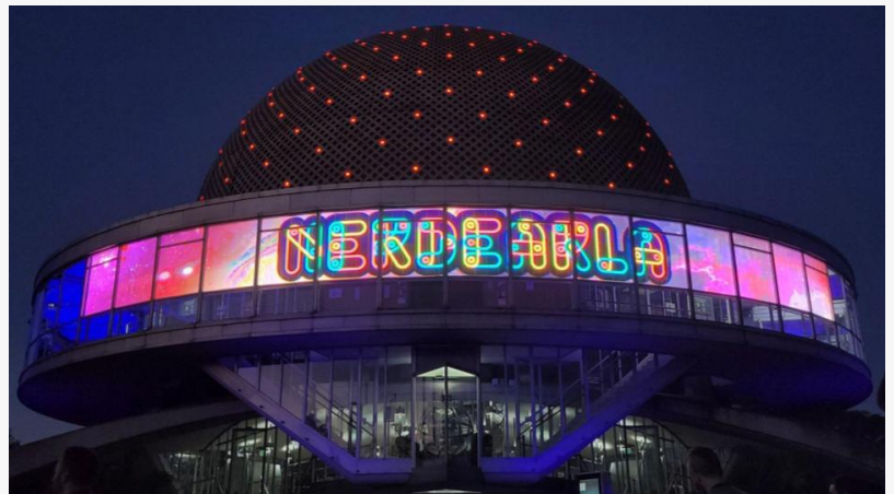
The Buenos Aires Planetarium showing Nerdearla's logo