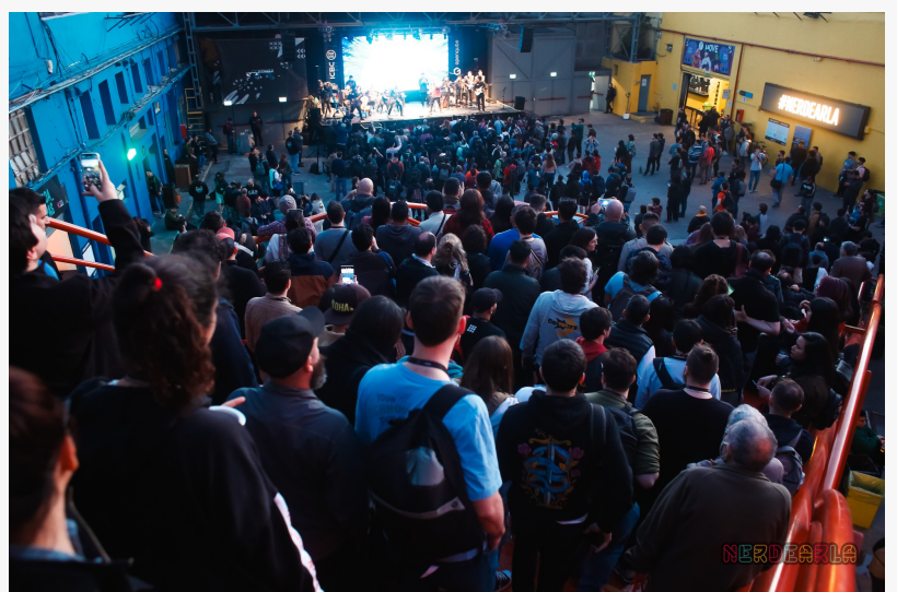
Nerdearla's audience watching a performance by local nerd orchestra

This press release can be viewed online at: https://www.einpresswire.com/article/746287980