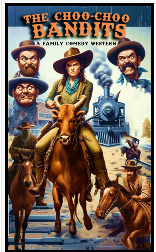
The Choo Choo Bandits

When news spreads that a Union Pacific train carrying the largest shipment of gold bars in U.S. history will pass through Rattlesnake Ridge, Maude seizes the opportunity for a life-changing heist. After enlisting Buster's help to devise a plan, they mistakenly receive faulty information from Felix Archie Amos, the town's notorious snitch, setting the stage for their comically