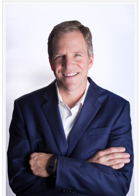
Scott Parazynski, MD

"I'm excited to join NeuroLight's Advisory Board, leveraging my passion for exploration and innovation to improve human health and well-being," said Dr. Parazynski. "NeuroLight's pioneering technology has the potential to transform lives, and I'm eager to contribute to this