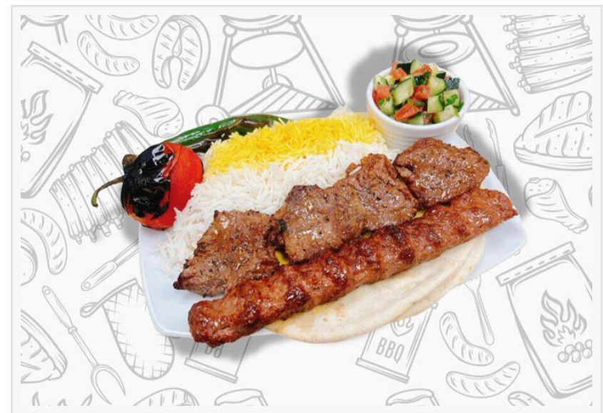
Hook Kabob Top Mediterranean Restaurant

Hook Kabob has become a cultural and culinary icon within Van Nuys, known for its diverse menu featuring Mediterranean flavors that highlight