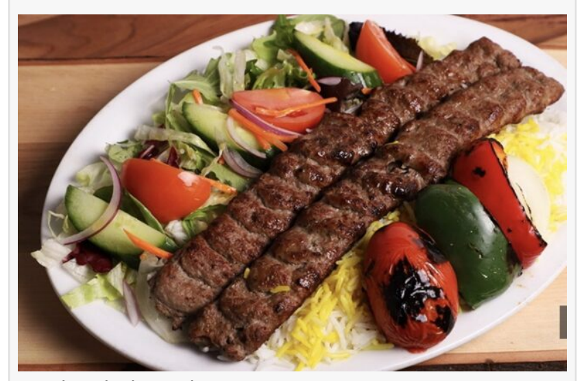
Hook Kabob Mediterranean Cuisine

Iranian and Armenian culinary traditions. With a menu rich in options, from kubideh (lamb, beef, or chicken kebabs) to the customer-favorite grilled chicken with a choice of sweet, spicy, or smoky seasonings, the restaurant has something to satisfy every palate. Patrons from nearby Lake Balboa, Sherman Oaks, and other areas in Los Angeles County flock to the restaurant for these traditional dishes that evoke the true essence of Mediterranean cuisine.