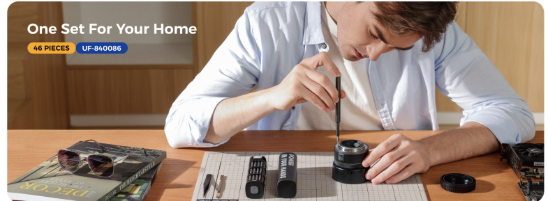
46-in-1 Screwdriver Set