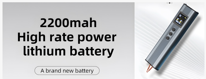
Mini Portable Handheld Battery Spot Welder