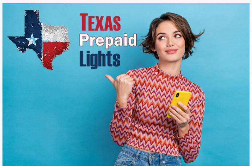
Choose Texas Prepaid Lights!