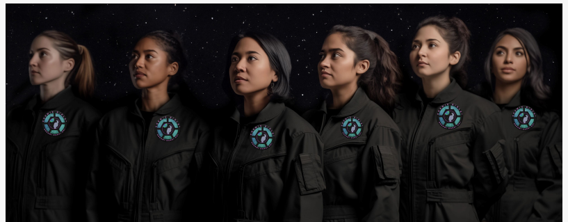
Worldclass commercial astronaut training

To mark the start of World Space Week 2024, Cosmic Girls™ invites girls from around the globe