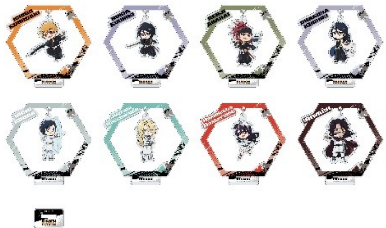
Yura-yura Acrylic Stands (8 designs) / 660 yen (tax incl.)