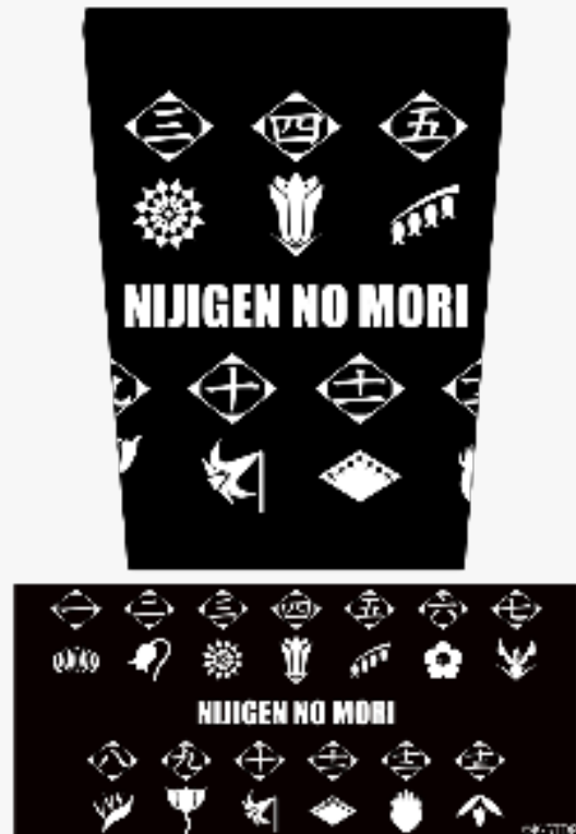
Thermo-Tumbler / 2,200 yen (tax incl.)

BLEACH is a smash-hit sword-battle action manga, that ran in the pages of Shueisha's Weekly Shonen Jump magazine from 2001 to 2016. Since its debut, the 74-volume manga series has received tremendous support from fans, selling over 130 million copies worldwide. The series was also adapted into an animated TV series that aired in Japan from 2004 until 2012 and that included four feature films.