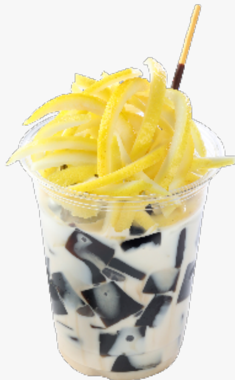
Ichigo Kurosaki's Orange Peel Coffee Jelly / 700 yen (tax incl.)