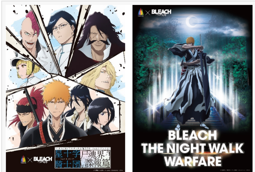
"BLEACH" Dramatic Riddle-Solving Rally in Nijigen no Mori, "Stern Ritter Espionage Mission in Soul Society" and "BLEACH THE NIGHT WALK WARFARE"

The event is comprised of two parts - "BLEACH THE NIGHT WALK WARFARE" (night event) and "'BLEACH' Dramatic Riddle-Solving Rally in Nijigen no Mori, 'Stern Ritter Espionage Mission in Soul Society' " (midday event), immersing guests in the world of the anime "BLEACH: Thousand-Year Blood War".