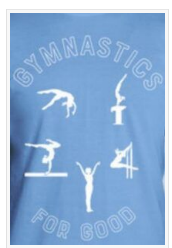
12 Year Old Tween Grips & Flips, works on Girls Design Tomorrow program; she designed Gymnastics Tee for her community www.GymnasticsforGood.com