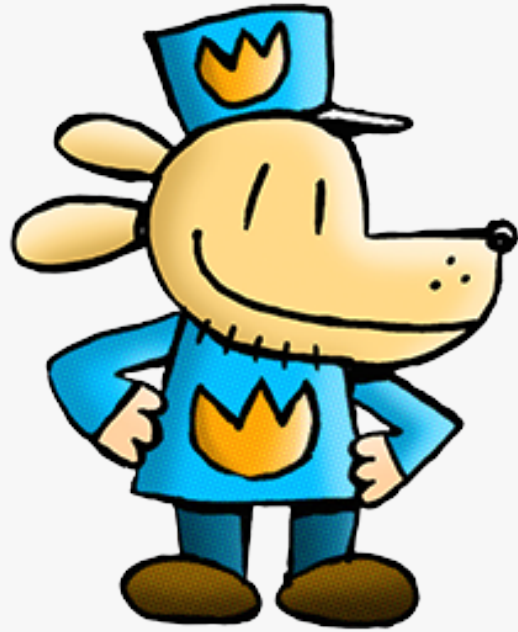
Dav Pilkey's Dog Man

This press release can be viewed online at: https://www.einpresswire.com/article/746420955