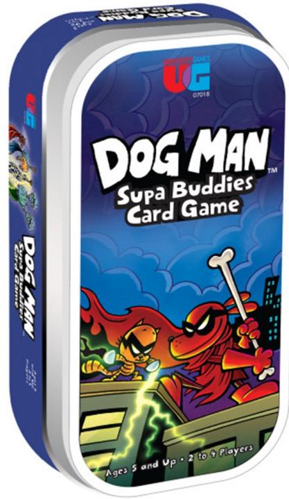
Dog Man Supa Buddies Card Game