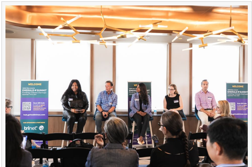
Emerald Summit Panel Presented by Wallet Max

EINPresswire.com/ -- As Climate Week NYC aligns with the United Nations General Assembly, President Joe Biden presented his climate policies dedicated to sustainability at the Bloomberg Global Business Forum, marking the beginning of Climate Week. One of the notable highlights of Climate Week NYC was the Emerald Summit , which took place on Friday, September 20, 2024, in New York City. This event brought together a diverse group of over 200 attendees, including startup founders, impact investors, and C-suite executives.