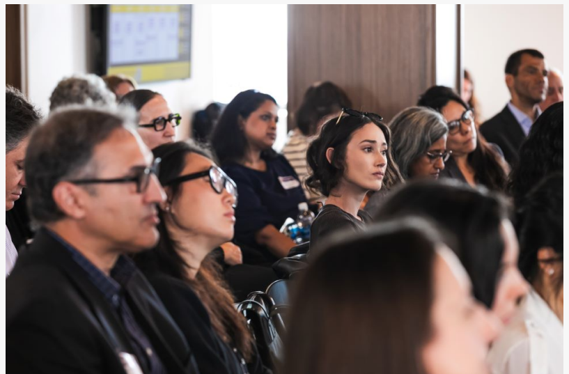
The Emerald Summit 2024 - Presented by Wallet Max