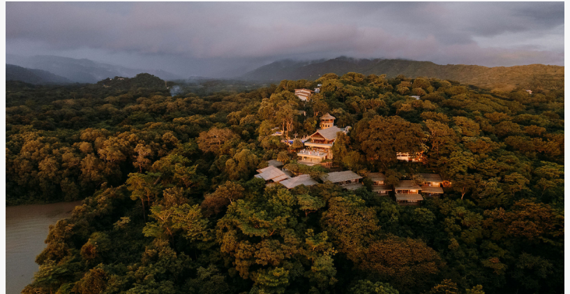
An aerial overview of Lagarta Lodge.