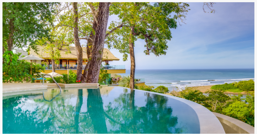
Lagarta Lodge's iconic views.

NOSARA, COSTA RICA, October 1, 2024 /EINPresswire.com/ -- Condé Nast Traveller today announced the results of its annual Readers' Choice Awards with Hotel Boutique Lagarta Lodge recognized as the #3 Best Resort in Central and South America.