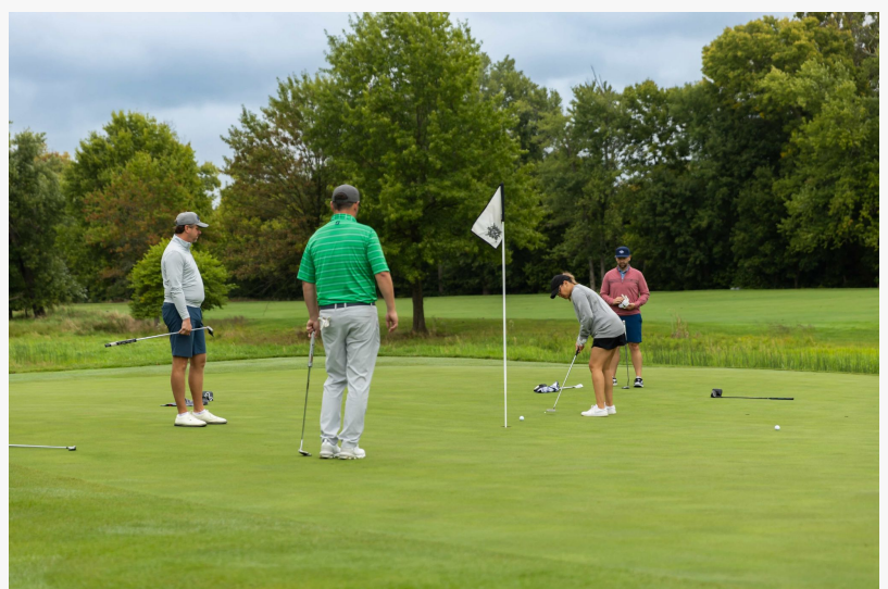
More than 300 data center professionals teed off to raise money for the community.