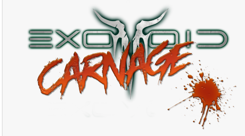
Exovoid Carnage Logo

studio is committed to creating skill-driven games that test players' tactical abilities and reflexes. With Exovoid Carnage marking its bold entry into the competitive arena shooter genre, Man Up Time Studios is set to deliver even more high-energy, action-packed titles that will push the limits of skill-based gameplay.