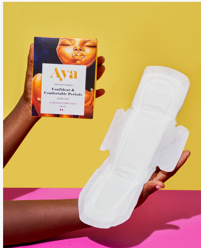
Aya sanitary pads with wings