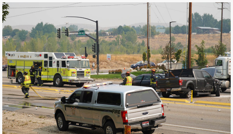
Car accident in Eagle, Idaho

We can see that for 2022 and 2023, aggressive driving made up for roughly the same number of