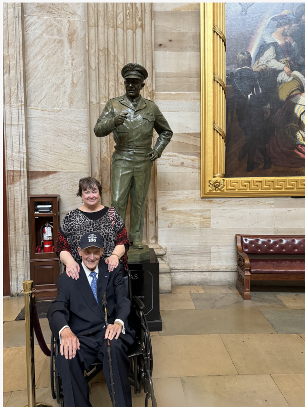
Jean Becker and Judge William Webster in The Capitol Rotunda

This press release can be viewed online at: https://www.einpresswire.com/article/746571207 EIN Presswire's priority is source transparency. We do not allow opaque clients, and our editors try to be careful about weeding out false and misleading content. As a user, if you see something