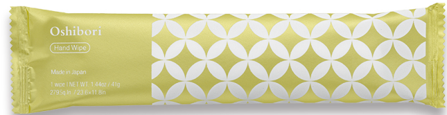
WAGARA Ichimatsu Aka / WAGARA Sippou Kin