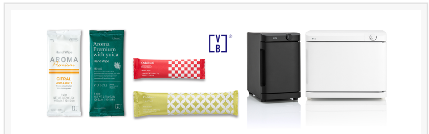
FSX Launches 'VB-COSME-' Japanese Hygienic 'Oshibori' Hand Wipes in the U.S.

FSX's patented VB (Virus Block) hand hygiene technology, inhibits viruses and bacteria on hand