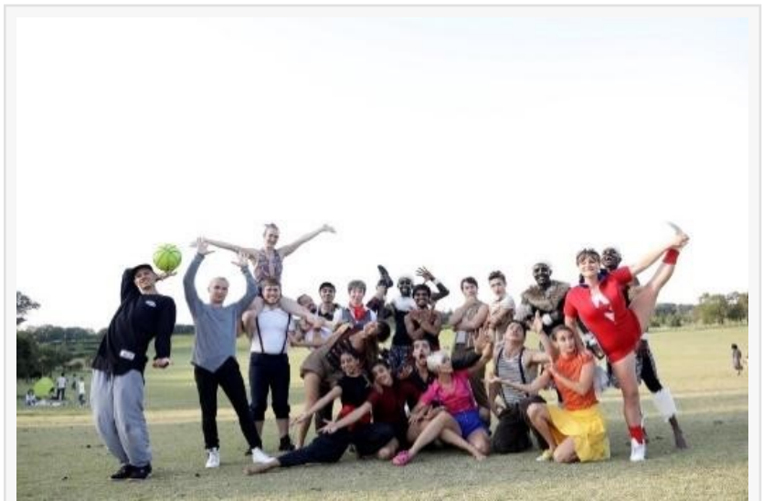
Artists from all over the world gather on Awaji Island