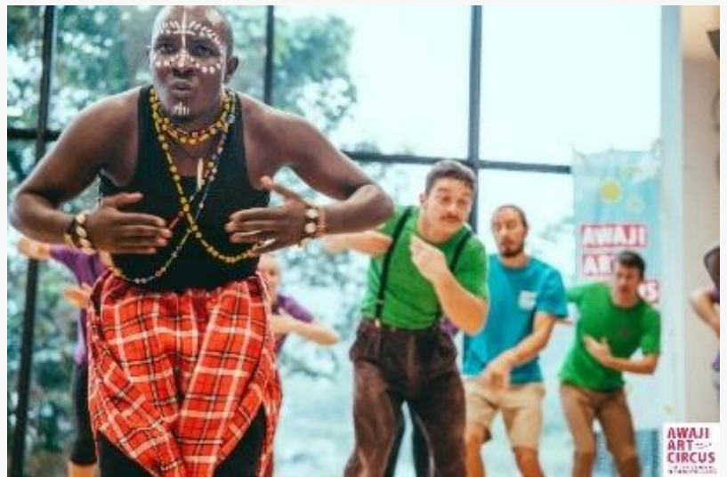
Past performances have been held in Tohoku, Tokyo, and other cities