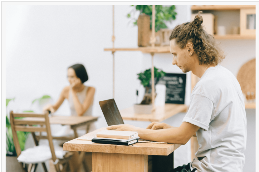
global freelancer workforce

Freelancers are playing an increasingly critical role in cross-border trade, especially in emerging markets.