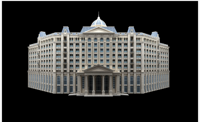
Architectural BIM Model for Hotel