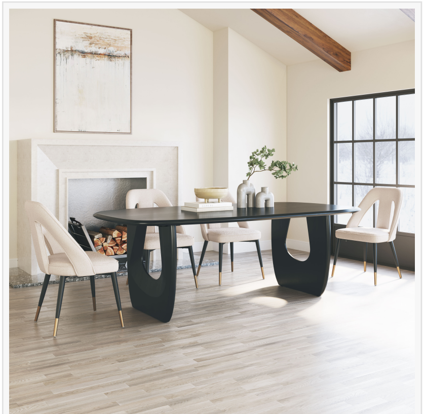
Introducing ZUO's Arasan Dining Table, a masterpiece crafted from solid Acacia wood. Its modern, organic shape strikes a harmonious balance between minimalist and maximalist design.

Founded in 2005 by entrepreneurs Luis Ruesga and Steve Poon, ZUO is known for its ability to bring a bold and eclectic mix of mid-century modern, contemporary and industrial chic styles