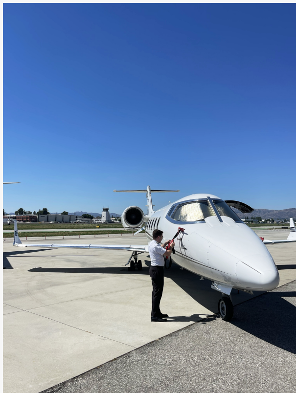
A pilot prepares his Learjet 60 ahead of a recent charter for Amalfi