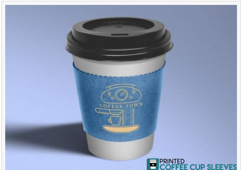
Sip In Style! Our Printed Coffee Cups Are Perfect For Showcasing Your Brand.

The brand aims to make every detail stand out. The mission is not to treat the coffee cup holders as accessories but as an extension of coffee rituals; they focus on redefining the definition and approach to be more sustainable and practical.