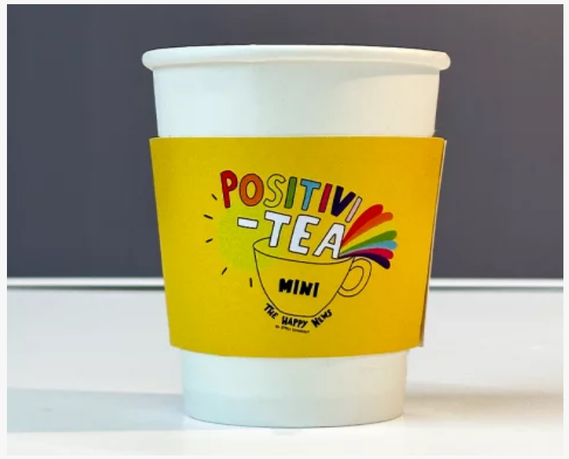
Your Brand, Your Style! Let Your Coffee Cups Do The Talking With Vibrant Prints.