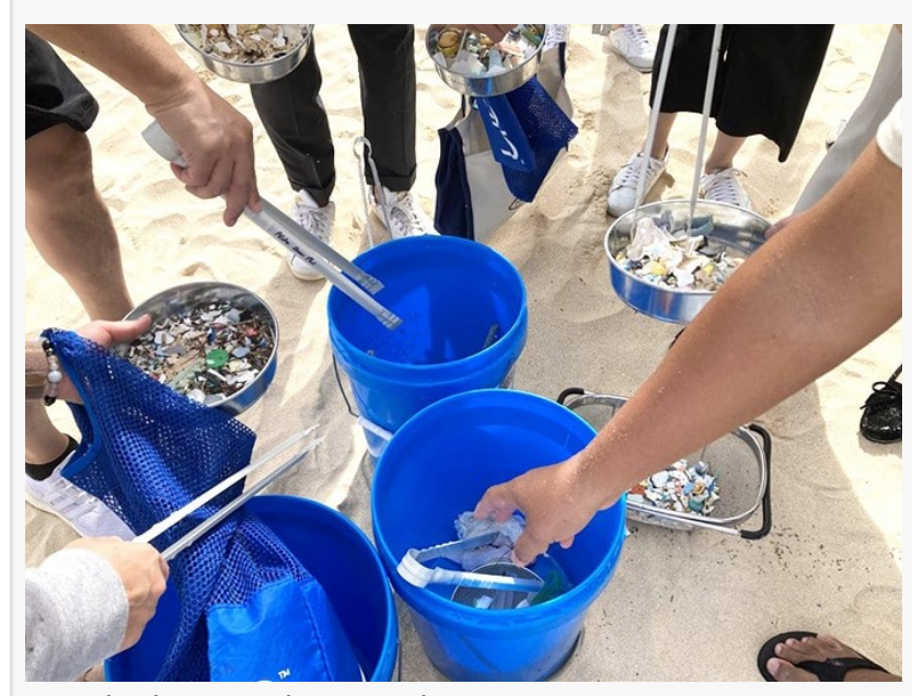
Beach clean-up kit rental

and organizing events at the LeaLea Lounge in collaboration with "The Genki Ala Wai Project", a local NPO aiming to improve the water quality in the Ala Wai Canal, where we tossed about 3,000 mud balls with our customers to digest sludge.