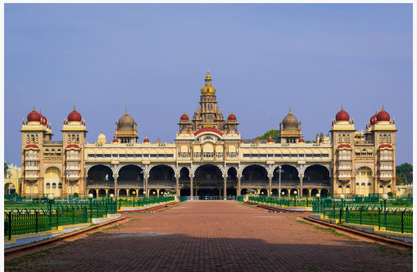
Mysore Palace: A stunning blend of Indo-Saracenic architecture, illuminated in all its grandeur