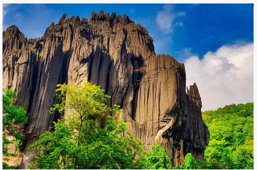
Yana Caves in the Heart of Karnataka

Karnataka Tourism warmly invites Japanese travel professionals, tour operators, and media to attend the roadshows and discover the many reasons why Karnataka is the ideal destination for their clients. The roadshow in Kyoto will be held at the Ana Crown Plaza on 30th September, and the Osaka event will take place at the Imperial Hotel on 1st October. Both events will feature