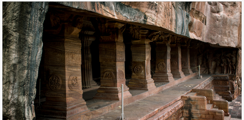
Badami Caves, A masterpiece of ancient Indian craftsmanship.

The delegation will focus on Karnataka's UNESCO World Heritage Sites, including the iconic