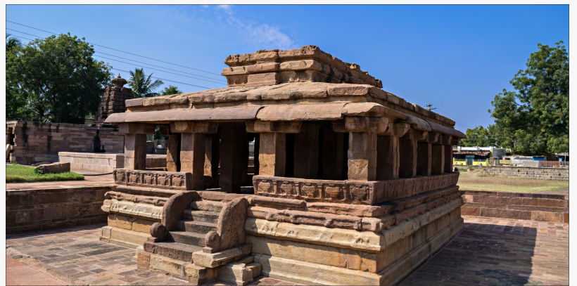
Aihole: A treasure trove of Buddhist, Hindu, and Jain art