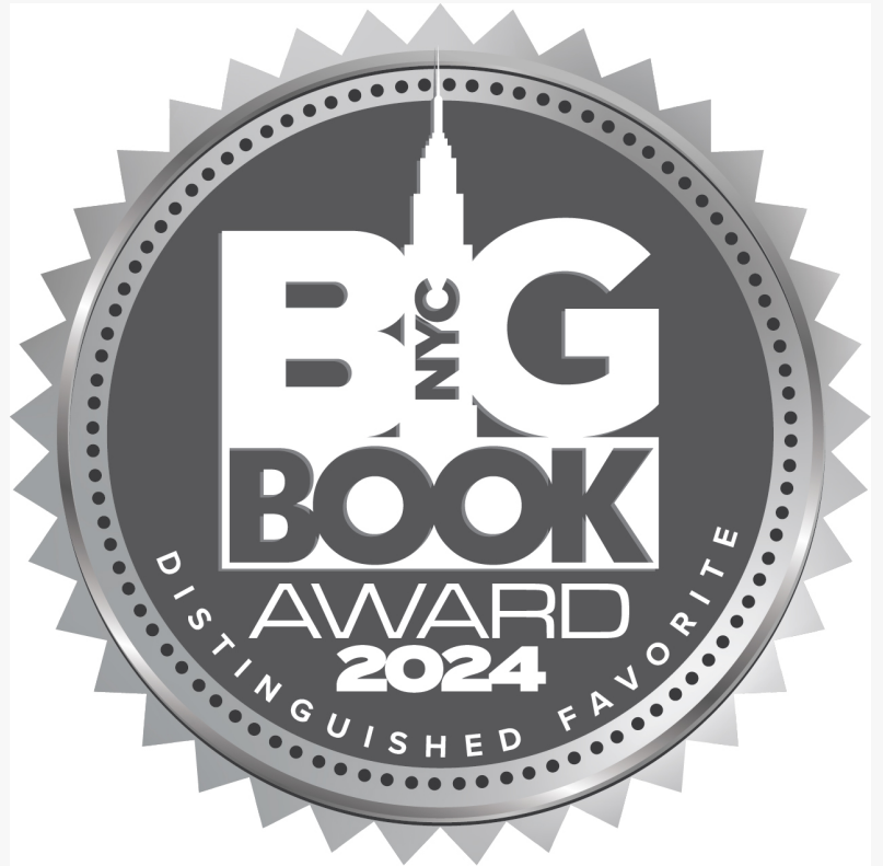
A 2024 NYC Big Book Award Distinguished Favorite