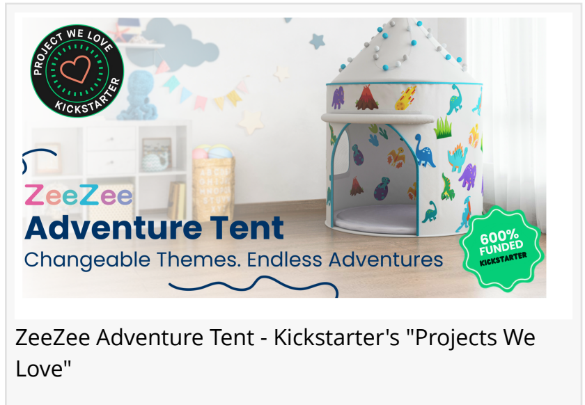
ZeeZee Adventure Tent - Kickstarter's "Projects We Love"

600% of its target within a few short weeks. The company reached its funding goal within just 24 hours of launch, as the ZeeZee Adventure Tent continues to soar, captivating families, educators, and partners worldwide.