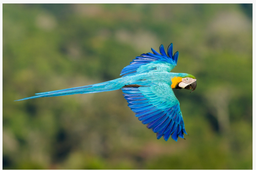
Sustainable travel helps protect Amazon wildlife by supporting conservation and preserving natural habitats for countless species.