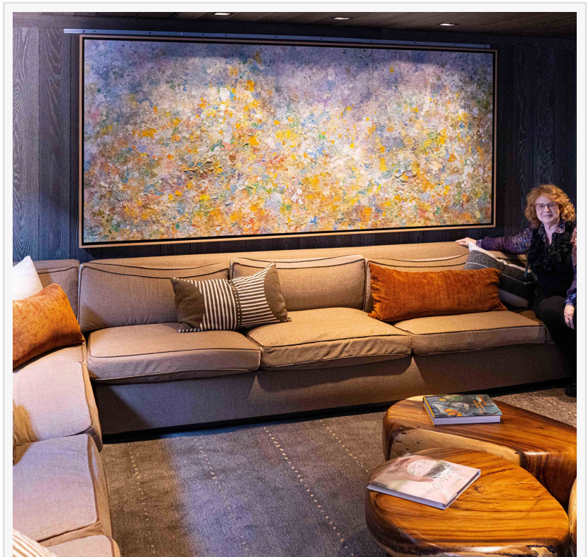
Reception, Miraval Berkshires

After an intense career on Wall Street and in the corporate media world, I needed to take a breath and find a peaceful place. Painting idyllic, imaginary places like Shangri La became an escape and a place to explore. The iterative process of layering and finding the perfect blend of colors and textures has become a meditative exercise where time is not a factor. Shangri La is a fantasy place to get lost in."