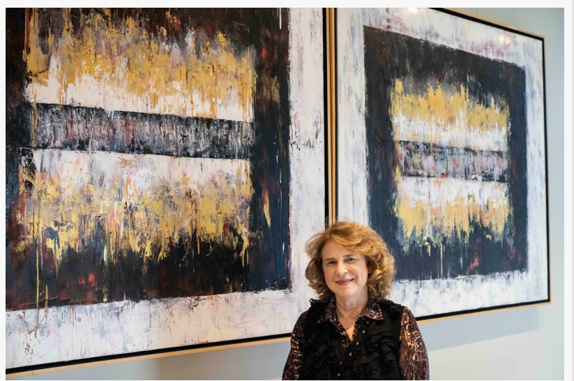
Body Mindfulness Center, Miraval Berkshires

Aurora Borealis symbolizes the joy that comes with exploring my creative spirit -- soaring, sweeping and sparkling. Contrasting light and dark, Aurora Borealis examines the sky and its celestial beauty."