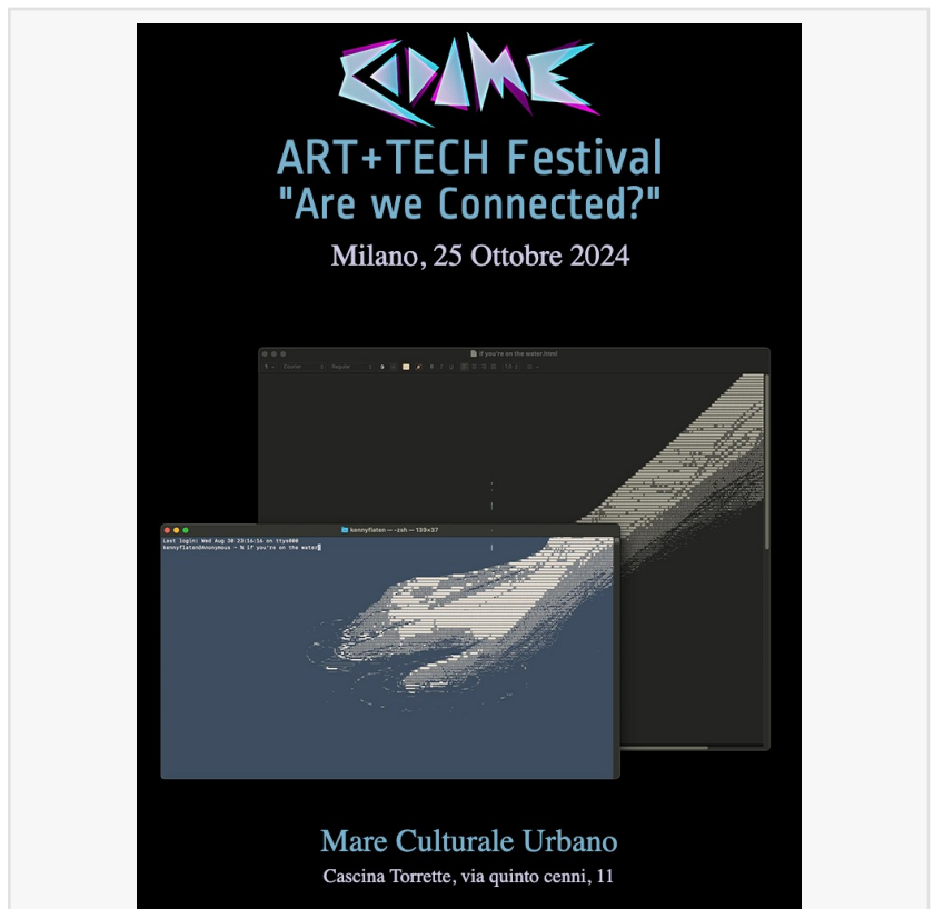
ART+TECH Festival (2024) - Are We Connected?

“Essence speaks to the core of what drives creativity—whether it’s a brushstroke, a piece of code, or a collaboration between human and machine. This year’s festival challenges us all to peel