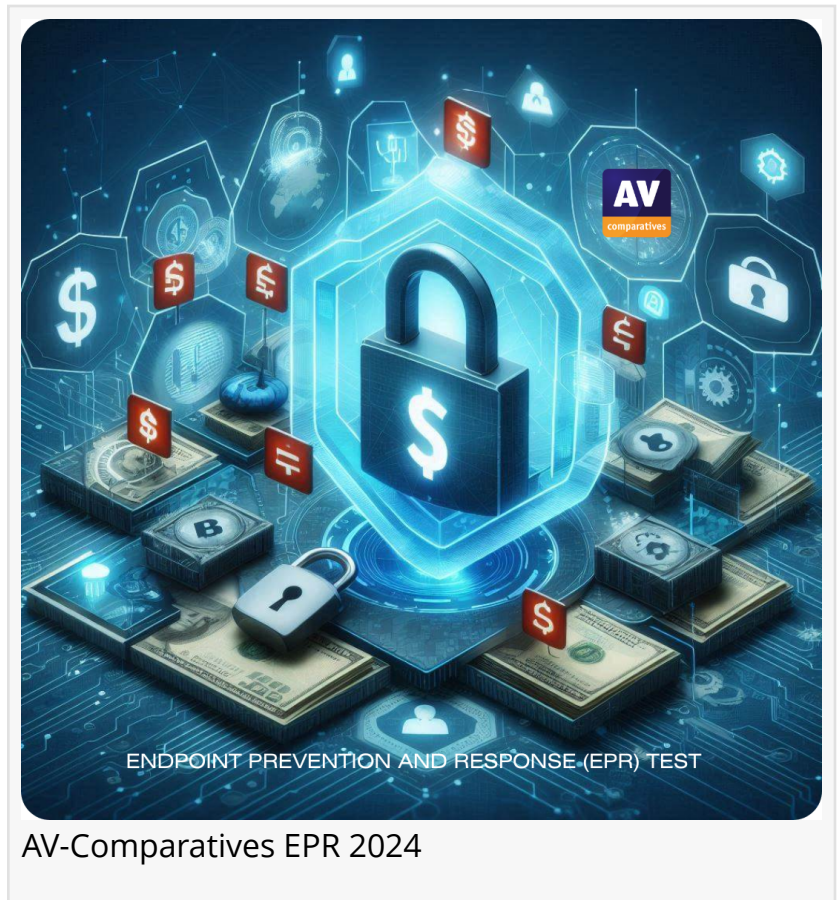
AV-Comparatives EPR 2024

Endpoint Protection Products (EPP), Endpoint Detection and Response (EDR), and Extended Detection and Response (XDR) solutions are vital components of enterprise security, providing defenses against targeted threats such as advanced persistent threats (APTs). AV-Comparatives' Endpoint Prevention and Response (EPR) Test is designed to evaluate the effectiveness of these solutions in countering complex, multi-stage attacks that target an organisation's entire infrastructure.