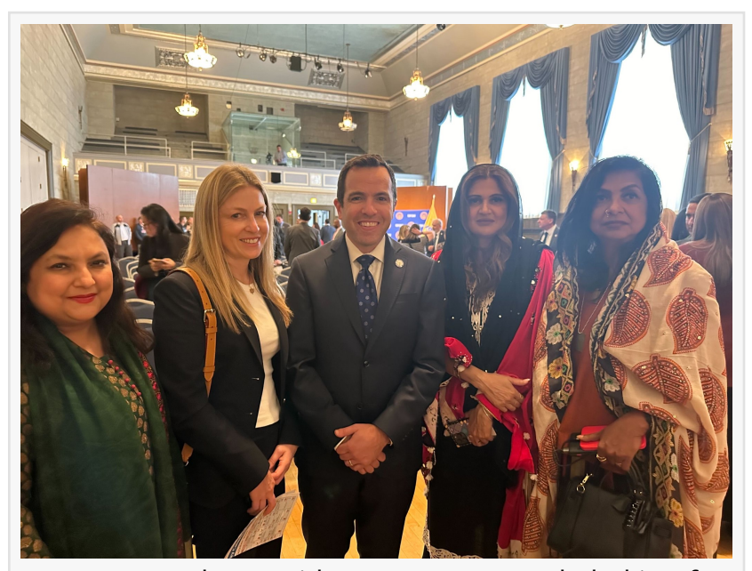
AMMWEC and ADL with Attorney General Platkin of the State of New Jersey

The Muslim women delegation attended the Fireside Chat with