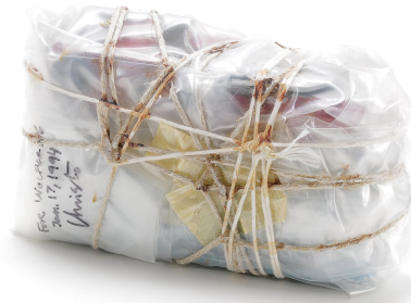
Back of 'Wrapped Leica' M4 camera, foil/cord-wrapped and hand-inscribed, signed and dated by Christo (Bulgarian, 1935-2020) on Jan. 17, 1994. Estimate: $89,390-$111,740