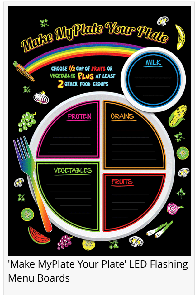
'Make MyPlate Your Plate' LED Flashing Menu Boards

© 1995-2024 Newsmatics Inc. All Right Reserved.