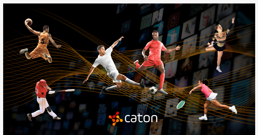
Caton Media XStream - Revolutionary IP Broadcast Solution Powered By AI

Ran Too Ker Wei Caton Technology +65 6980 0591